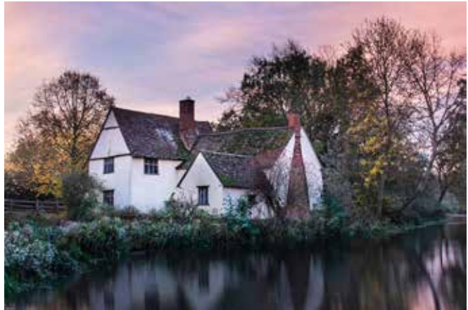
Right: 'Willy Lott's cottage' by Shaun Hykel CPAGB of Colchester PS.