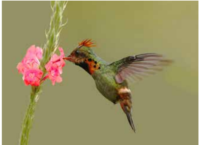
'Right: Image no. 9' by David Pelling LRPS CPAGB from Wy- mondham PS.