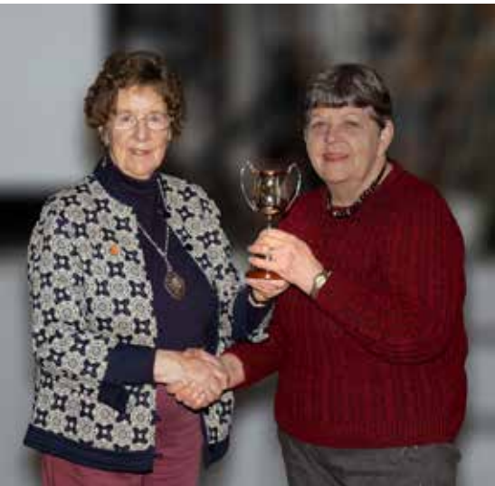
'Young Polar Bear'