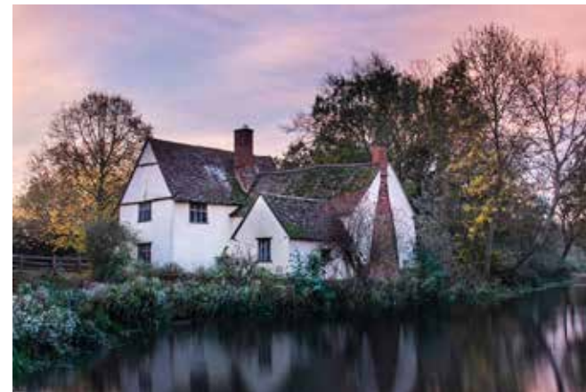
Right: 'Willy Lott's cottage' by Shaun Hykel CPAGB of Col- chester PS.