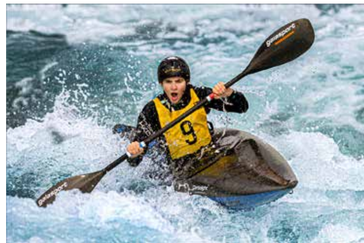
Left: 'Lee Valley canoeing No 9 with Pole'.