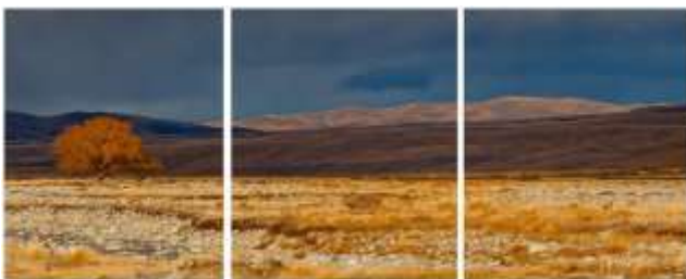
One image split into three